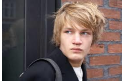
Kent The Steady